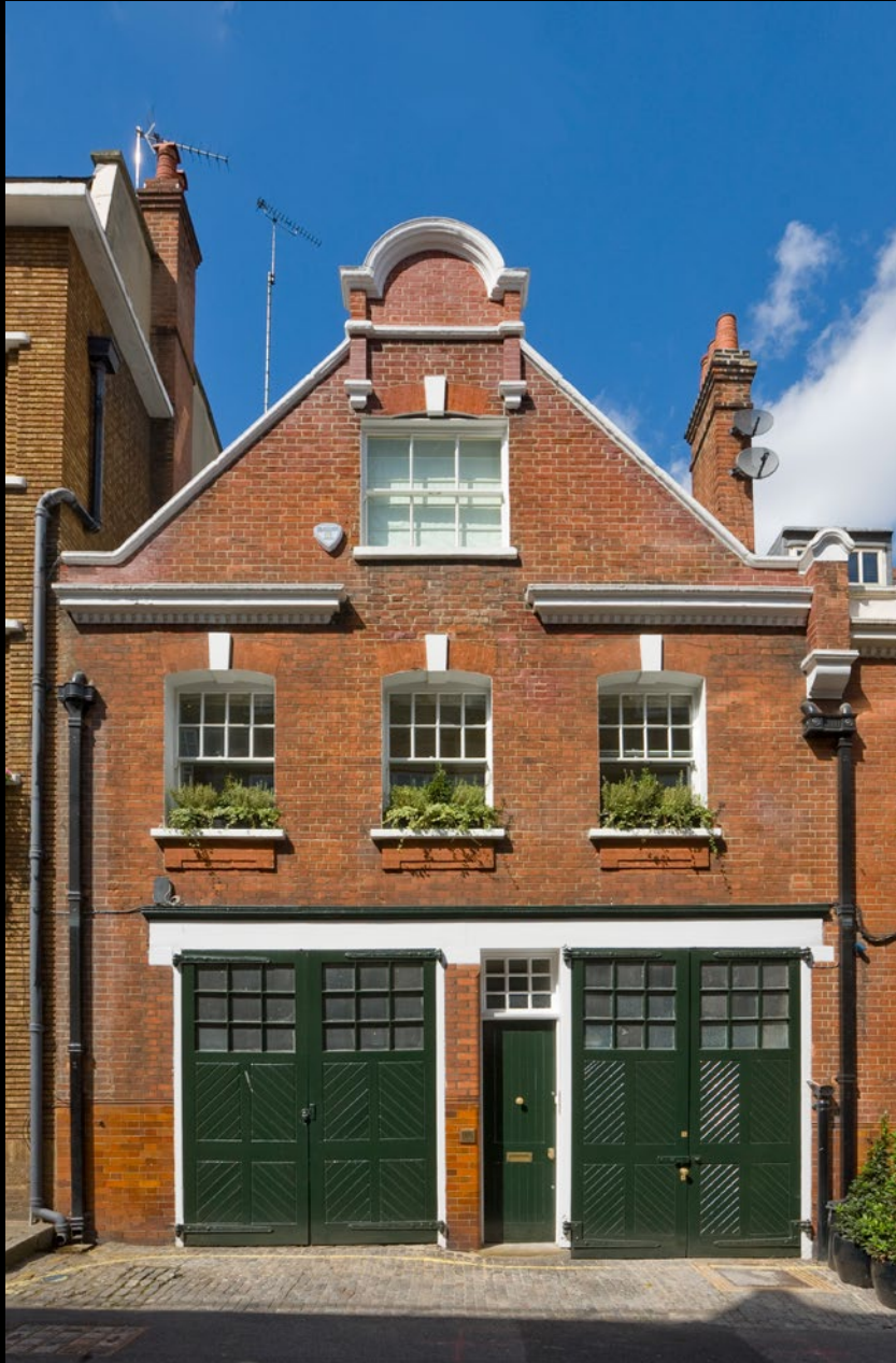
40 Bruton Place